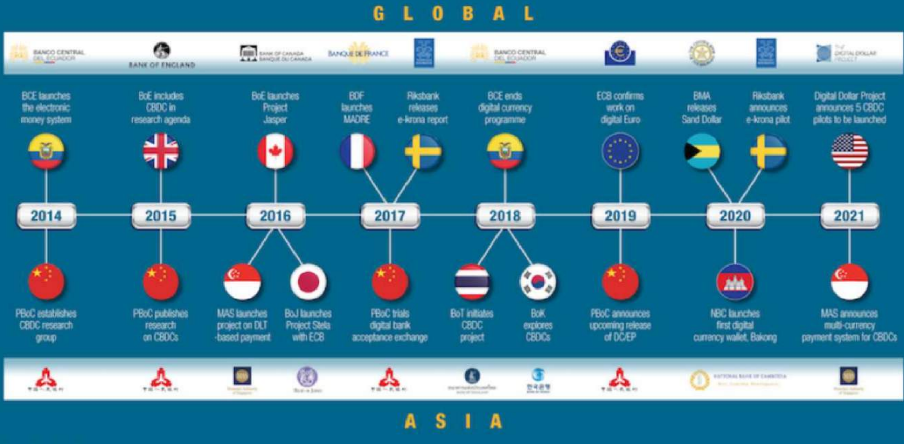
Fig 1.0 - Bahamas becomes the first country to officially launch a CBDC